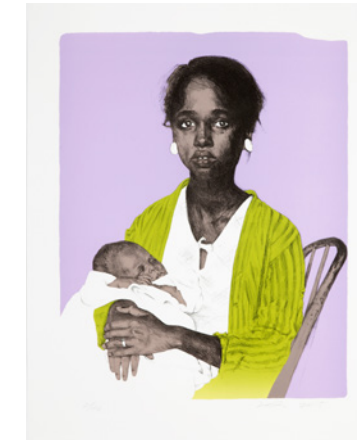
Hung Liu, Black Madonna, 2016

Essaydi challenges the hypersexualized and stereotypically submissive depictions of Muslim women by reclaiming their bodies, spaces, and stories. Harem 14C depicts a Moroccan woman whose body is masked by the pattern of her clothing and henna body art, all of which blends into the highly decorated architectural space of the harem that surrounds her. Traditionally seen as the domestic building dedicated to women in a Muslim household, the harem came to be regarded by Europeans as an eroticized space of male fantasy. Essaydi's photograph confronts this fiction and presents the woman's face, hands, and feet as visible signs of resistance to this tradition. On her exposed skin, viewers glimpse pieces of the poetic narratives that record the woman's story in henna. Essaydi engages the space of the harem to challenge stereotypes and initiate dialogue about the lives of contemporary Muslim women living in Morocco. While initially seen as scandalous in her home country, Essaydi's works gained widespread recognition and became a source of national discussion when several were acquired for the private collection of King Mohammed of Morocco.