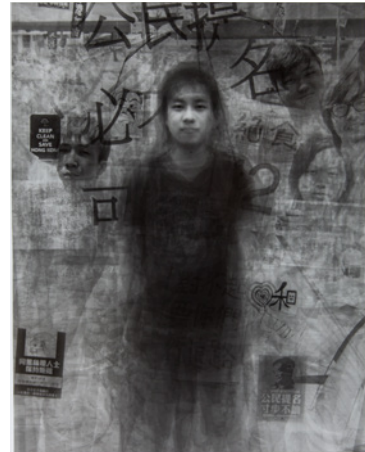
Ken Kitano, 25 Participants at 2014 Hong Kong Protests "Umbrella Revolution", 2014

Issues of nationhood are central to a number of works in the exhibition. Ken Kitano's 25 Participants at 2014 Hong Kong Protests "Umbrella," occupied area (Admiralty, Causeway Bay, Mong kok), Hong Kong, October 12–14, 2014 considers student-led protests against reforms that would give mainland China more control over Hong Kong's electoral system. In this multi-exposure photograph, Kitano superimposes the faces of twenty-five different protesters