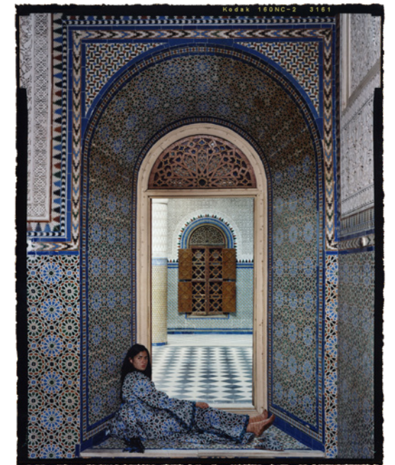
Lalla Essaydi, Harem, #14C, 2009

In her photographs, Moroccan-born artist Lalla Essaydi challenges the hypersexualized and stereotypically submissive depictions of Muslim women by reclaiming their bodies, spaces, and stories. Harem 14C depicts a Moroccan woman whose body is masked by the pattern of her clothing and henna body art, all of which blends into the highly decorated architectural space of the harem that surrounds her. Traditionally seen as the domestic building dedicated to women in a Muslim household, the harem came to be regarded by Europeans as an eroticized space of male fantasy. Essaydi's photograph confronts this fiction and presents the woman's face, hands, and feet as visible signs of resistance to this tradition. On her exposed skin, viewers glimpse pieces of the poetic narratives that record the woman's story in henna. Essaydi engages the space of the harem to challenge stereotypes and initiate dialogue about the lives of contemporary Muslim women living in Morocco. While initially seen as scandalous in her home country, Essaydi's works gained widespread recognition and became a source of national discussion when several were acquired for the private collection of King Mohammed of Morocco.