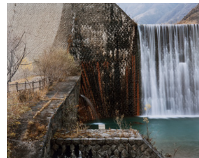
Toshio Shibata, Nikko City, Tochigi Prefecture (C-2245), 2013

Rather than present aesthetically composed views of the natural landscape with subtle traces of human intervention, Yao Lu starts with environmental waste sites, which he adorns to appear beautiful. In his photograph Viewing the City's Places of Interest in Springtime , he captures what at first glance seems to be a traditional Chinese mountain landscape painting. It is only upon closer inspection that one discovers the mountains to be mounds of garbage covered in green nets. Those elements initially perceived as representations of nature's beauty are in fact made up of trash that threatens the future of the natural world. Lu calls attention to the problem of waste in a rapidly industrializing China by upending the revered tradition of landscape painting and its status as a symbol of identity and national pride.