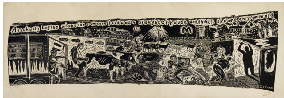
Sue Coe, Auschwitz Begins Whenever Someone Looks at a Slaughterhouse and Thinks: They Are Only Animals, 2009

Sue Coe is an ardent defender of animal rights. In Auschwitz Begins Whenever Someone Looks at a Slaughterhouse and Thinks They're Only Animals , she confronts the realities of meat production and consumption from the perspective of animals. In this long, woodblock print, men brutally herd cows and pigs into a walled enclosure for slaughter. Coe exaggerates the expressions on the faces of the animals, which appear more human than animal. By referencing the site of a well-known Nazi concentration camp and adding barbed wire to the top of the slaughterhouse walls, Coe likens the present-day treatment of livestock to acts of murder committed by the Nazis. The surrounding city suggests that the cruelties of the slaughterhouse, like those of Auschwitz, take place in towns everywhere. Coe draws heavily from the artistic style of the emotionally charged work of Expressionist printmakers, particularly Käthe Kollwitz (German, 1867–1945), and emulates her use of powerful, affordable, and widely circulated prints as a means to draw attention to pressing social issues and foster good.