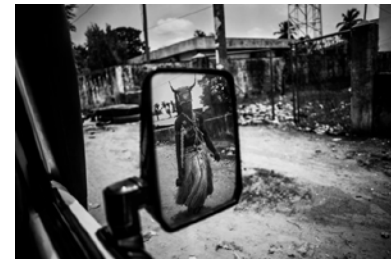
Manu Brabo, The Silent Conflict of Casamance, 2014

alluding to the condescending, "backward glance" of the modern at matters traditional and indigenous.